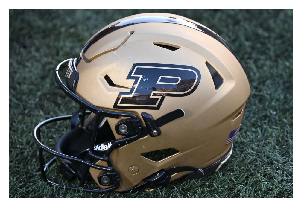
Special thanks to friends and family for making this possible.