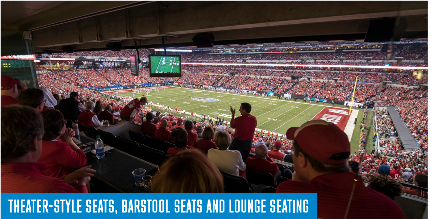
THEATER-STYLE SEATS, BARSTOOL SEATS AND LOUNGE SEATING