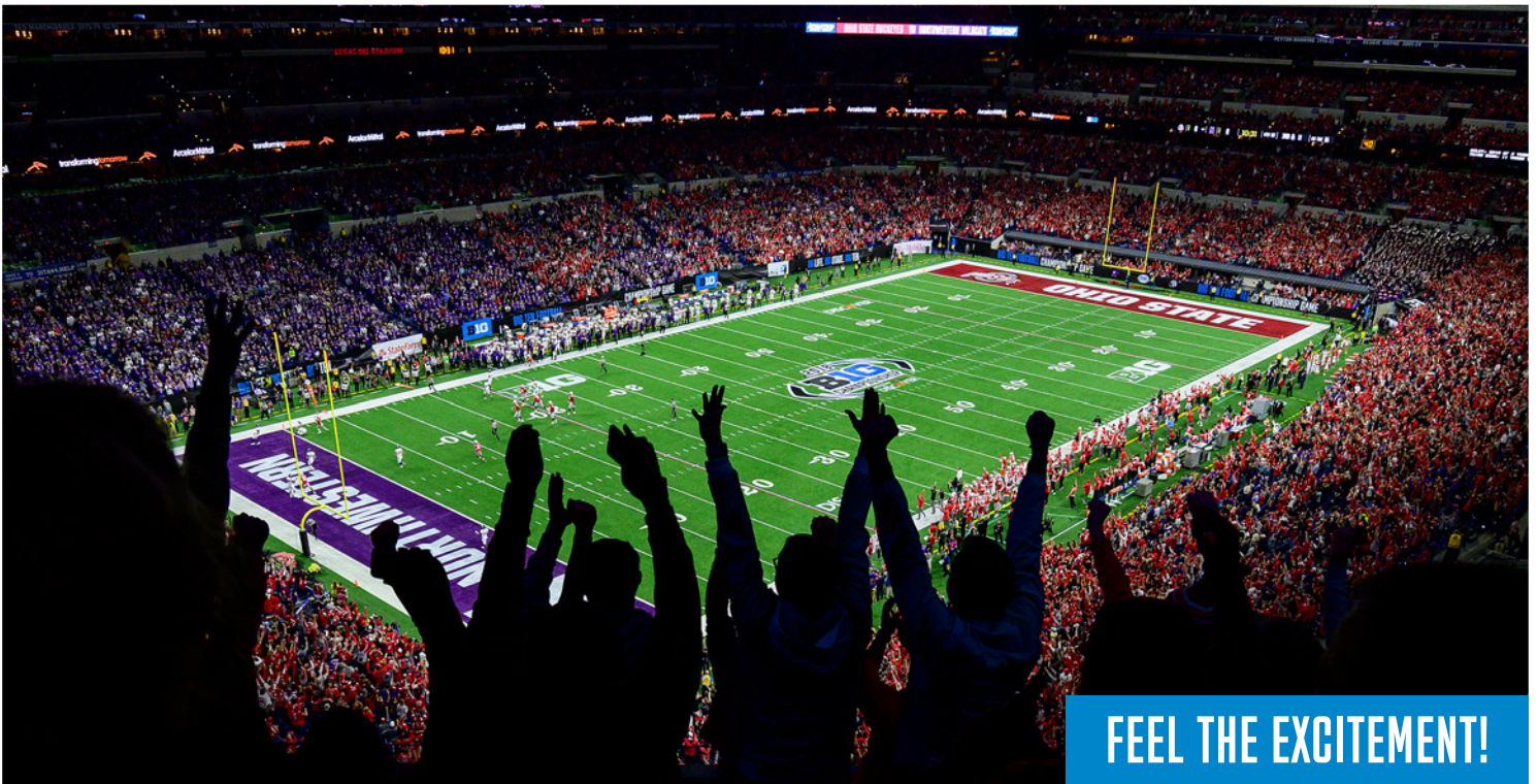
FEEL THE EXCITEMENT!