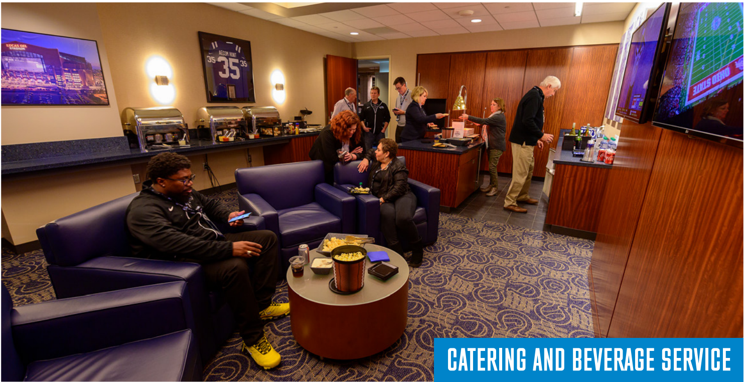
CATERING AND BEVERAGE SERVICE